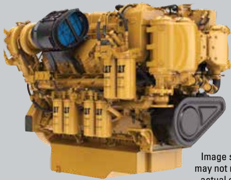
Image shown may not reflect actual engine

660 bhp 492 kW WOSR 1600-1800 rpm 750 bhp 559 kW WOSR 1600-1800 rpm