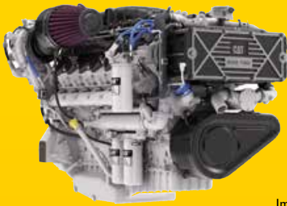
Image shown may not reflect actual engine