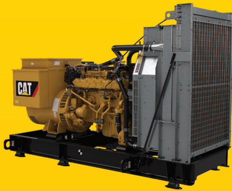
Image shown may not reflect actual engine

224 ekW 280 kVA 1800 rpm 274 ekW 343 kVA 1800 rpm