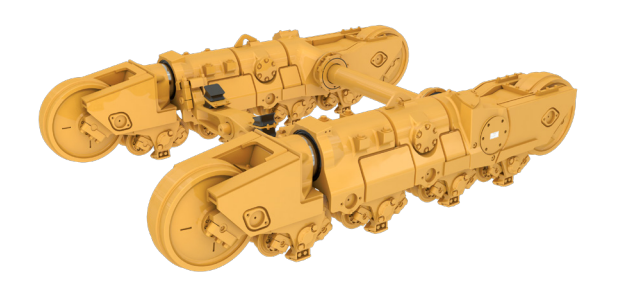
Tubular roller frame