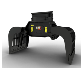
DEMO AND SORTING GRAPPLES