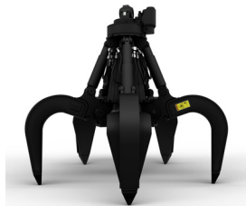
GSV – ORANGE PEEL GRAPPLES