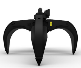
GSH – ORANGE PEEL GRAPPLES

Match your machine to the job. The MH3022 offers ten boom and stick combinations, while the MH3024 offers eight. The boom and stick options as well as multiple undercarriage configurations allow you to customize your machine to meet the demands of your application.