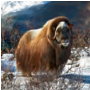
Dovre National Park, established in 2003, covers an area of 289km 2 at altitudes between 1,000 and 1,700 metres, and is home to wild reindeer and Europe's only herd of the rare musk oxen.

"We have a good, close relationship with PON Equipment, to keep our equipment up and running," confirms workshop manager Håvard Tronsmoen. "And the decision to choose Cat equipment is always an easy one. When you have Cat machines you can sleep easily. We keep our machines for between three and five years and spend a lot of time keeping them in shape. But we know we'll get a good resale price when we sell them, and you can't say that about every make of machine."