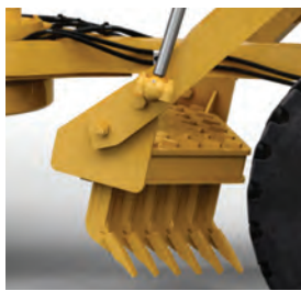
MID MOUNT SCARIFIER