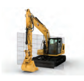
E-WALL CAB PROTECTION