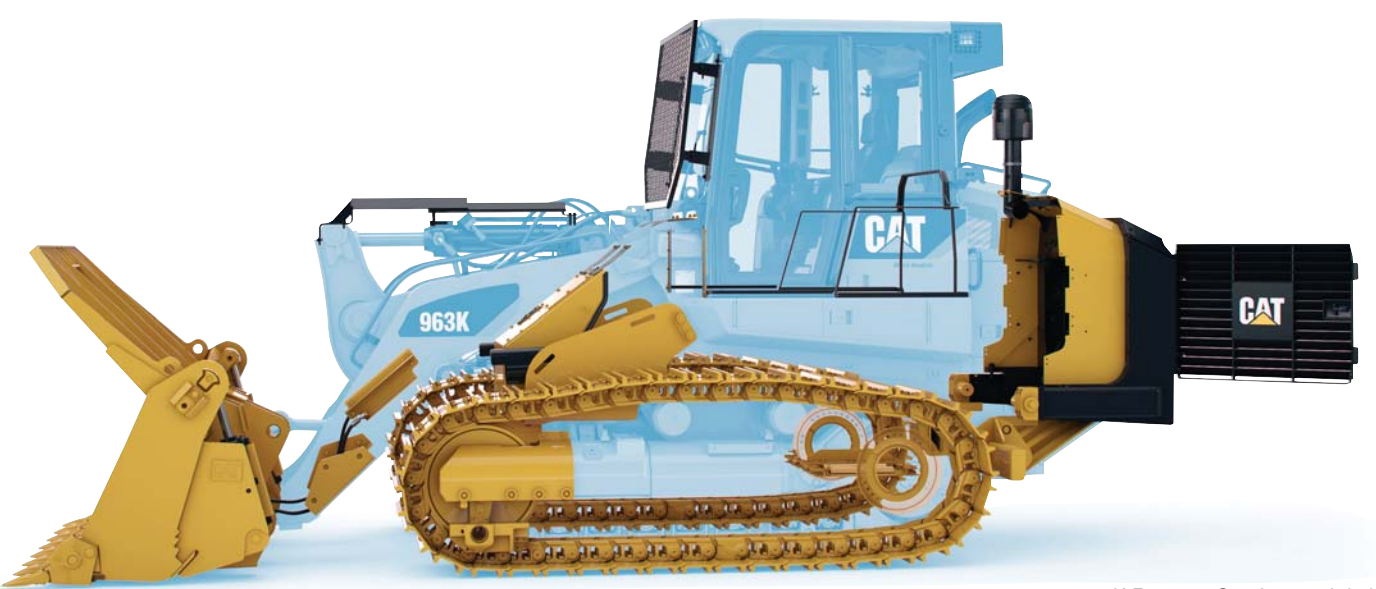
963K Extreme Service model shown.