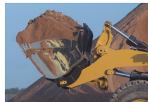
PERFORMANCE SERIES BUCKETS

The Fusion Quick Coupler System allows machines to use a wide range of tools that can each be picked up by machines of varying sizes. Fusion is designed to integrate the work tool and the machine by pulling the coupler and tool closer to the loader, increasing overall lift capability.