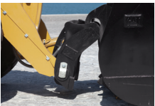
FUSION™ QUICK COUPLER