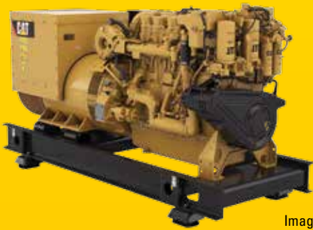
Image shown may not reflect actual engine