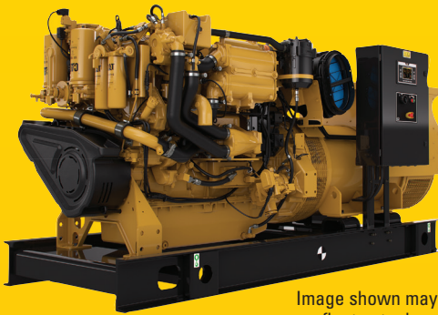
Image shown may not reflect actual engine

345 ekW 372 bkW 1800 rpm 430 ekW 465 bkW 1800 rpm