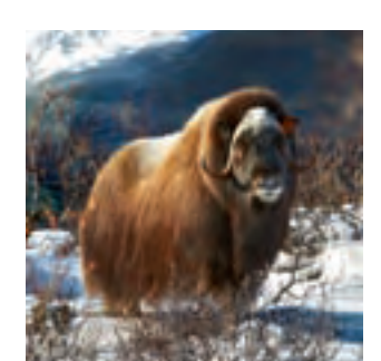
Dovre National Park, established in 2003, covers an area of 289km² at altitudes between 1,000 and 1,700 metres, and is home to wild reindeer and Europe's only herd of the rare musk oxen.